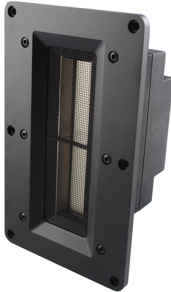
NeoPro5i True Ribbon Tweeter